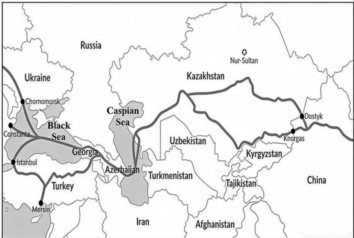
Fig. 2. The China-Europe freight train crosses both the Caspian and Black Seas