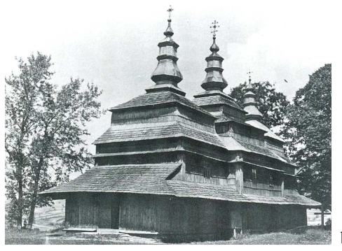
Fig. 3. Non-existent woden churches destroyed after the deportation of Ukrainians (in 1947) in Tisna commune: a) The church of St. Mykolay Chudotvorets from 1830 with a bell tower with "one dome" structure in Dovzhytsya, b) The church of the St. Martyr Dmytryj from 1875 with three-sector form and "three dome" structure in Smerek