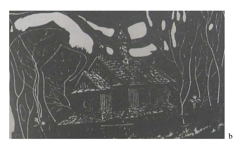
Fig. 4. Non-existent stone and wooden churches in Tisna commune: a) the church of the St. Martyr Dmytryj (1928, Ukrainian Bizantine style) in Vetlyna with "five dome" structure – the greatest in Carpathians region (destroyed in 1950); b) the church of Archangel Myhayil in Zubryache (1867, disassembled in 1953)

Kryve was an old Ukrainian village in Tisna commune. In 1939 there lived 290 Ukrainians. Their church of Ivan Chrestytel (Fig. 5a), along with a bell tower, was built in 1845 in the place of previous one. After deportation of Ukrainians from Kryve in 1947 church and bell tower were destroyed.