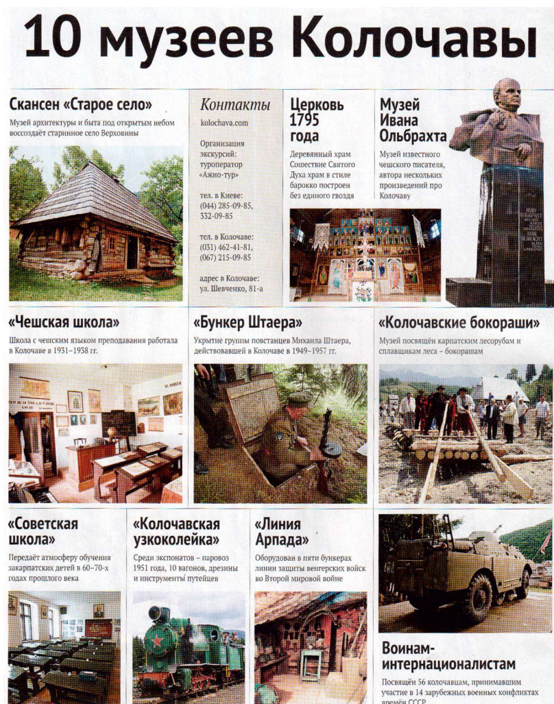
Figure 2. Museums of Kolochava willage

g) 120 rural households willing to develop rural green tourism.