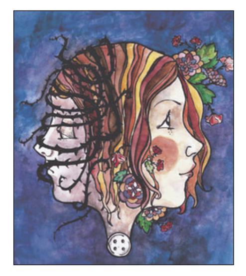
Fig. 8. Author and title are unknown. Respondent O.'s title - "My portrait"

When we look at these drawings, we can understand that it is not about sexual violence, but rather the fact that the outline of family relations balances on the verge of "life - non-life" (psychological death). Respondent O her choice of reproductions (Fig. 7) as follows: "I experienced an increased upbringing attention and numerous restrictions of activity from my parents, which mortified my needs, strivings and desires. I felt like a soldier-slave. My dependence on mother is a cage (bars), which blocks my brain now." (Fig. 7). A cage is an archetype of womb, but it is not childbearing and life-giving (there are no nourishing prerequisites – "water"). We want to remind that S. Freud named such form of masochism - "moral", though from the humanistic positions it should rather be called immoral. We suggest the neutral name -Platonic masochism. Since a person is becoming unfortunate unconsciously and under the conditions