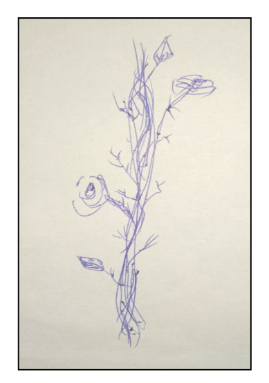
Fig. 6. Psychodrawing "Guilt tattoo" (A rose, entangled by barbed wire)

sexual deviations, by itself, by its nature is desexualized. It yields to the orientation at the genital sexuality by its attributes, aimed at punishment (whip, handcuffs, blindfold etc.). Dynamics of masochism is connected with balancing of the psyche on the verge of "lifedeath", which is a basal conflict. The latter is observed in the author's self-presentations, in particular in the reproductions, selected by respondent O. (Fig. 7 - 8).