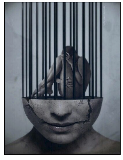
Fig. 7. Author unknown. Trap inside the mind. Respondent O.'s title - "How I feel"