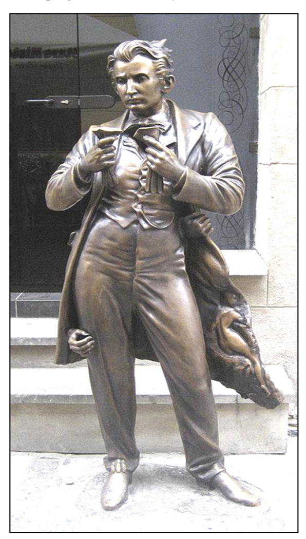
Photo 1. Monument to Leopold von Sacher Masoch, sculptor V. Tsysaruk, Lviv

weakening self-preservation due to the tendency for "to self-punishment". Masochism assimilates various life troubles and dramas of the psychic passions, set by subject's Oedipal dependences. Thus there are some grounds to assert that masochism is caused by the prehistory of the humanity development in the synthesis of traces (fixations) of the emotional loads, generated by the moral-ethical restrictions, with the Oedipus complex being the leading one among them ("incest taboo"). Strong emotional shocks of the humanity actualize the archaic constituent of a subject's psyche, which stimulates the tendency to self-punishment, which can be expressed in sadomasochistic initiatives. Under these conditions, a person realizes the personal potential through the sublimational channels of a human development (self-development) in accordance with the progress of the society.