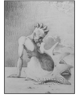
Fig. 19. A. Sargsyan. Shell

render pre-natal state. All this can be an additional proof of people having a tendency of returning to a womb.