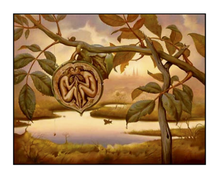
Fig. 17. V. Kush. Nut of Eden. The drawing chosen for self-presentation