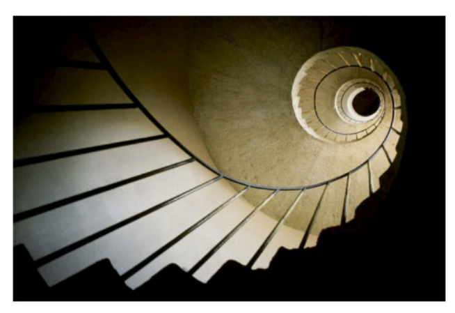
Fig. 9. Author and title are unknown. Respondent O.'s title - "Prospects of self-birth"

The foregoing proves that the tendencies to one's own self-punishment are set in the family by deprivation of a child's interests and needs. The paradox is in the way of solving the problem (desire) – "to be together with the parents". A child's psyche solves it through the unrealized process of introjection (absorption) of those requirements and features of the parents' behaviour, which disconnected them, moved them apart. unconscious has no unsolved problems, and this is just the prerequisite for moral masochism, which cannot be presented in a pure form – it always causes both physical (physiological) wastes, which is indicated by the above drawings, and a need of a selfbirth (to have a re-birth) (see Fig. 9), which simultaneously expresses a person's expectations to get rid of the problems set by the parents.