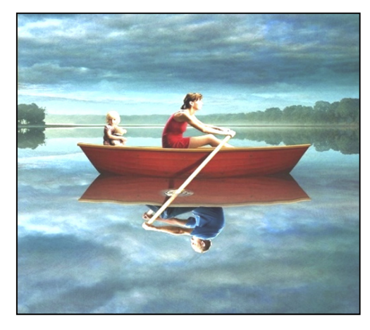
Fig. 5. I. Morskykh. Separation