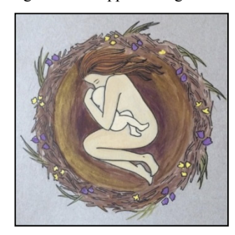
Fig. 16. Catie @SpiritYSol. Art of birth