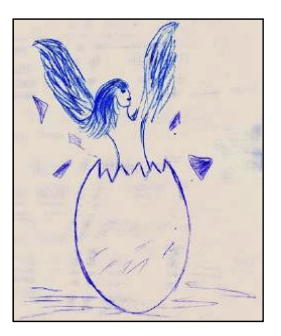
Fig. 13. I am approaching trouble