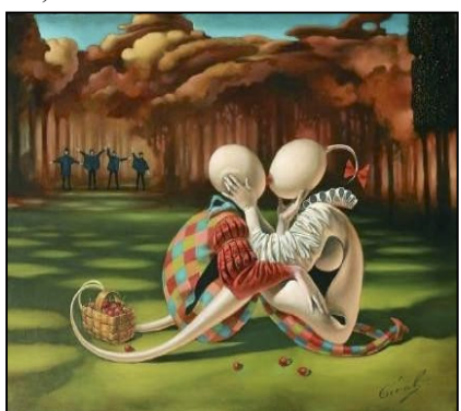
Fig. 20. M. Cheval. Title unknown

Analysis of the verbatim record material from ASPC groups draws our attention to the expressed imperative of the tendency to return to the womb, and this often transforms into a form of escape from real social problems. We also saw that some respondents wish to create "their own bosom", that is set by the indepth striving of the psyche for self-renovation and need of self-birth. As a rule, the latter is connected with the tendency of demarcation from the parents with the purpose of self-establishment and social selfrealization. We also observe the cases of searching for "the other half" to "be in the bosom", for example, as in Fig. 17 and Fig. 20; or search for a person with "similar problems". There is also a tendency to autonomy: everybody stays in "one's own bosom" (Fig. 16; 18).