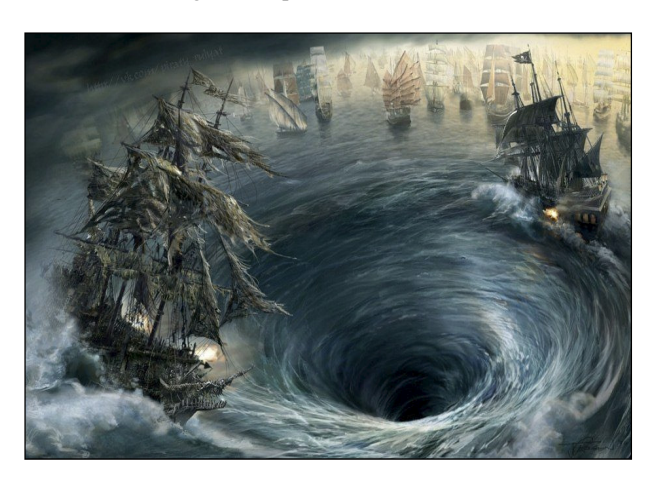
Fig. 4. R. Gonzales. Battle of Calypso. Respondent's title - "My feeling of self"

dead point" (stop); overcoming of the feelings mortification and some energy stagnation, caused by the delay of the parents' (Oedipus) complex, which can block a person's activity. It is reasonable that S. Hawking, who was not indifferent to the human psyche (he saw analogies in the quantum physics and the functioning of the unconscious sphere), stated that "The slogan of those who are falling into the black hole is: "Think imaginary!" [Hawking, 2014, p. 246]. Perhaps, this is why a person tends "to look for peace in storms" (whirlpool). The defense system which serves to preserve ("freeze") the destructions received in childhood, masks them through the distortion of the self-perception reality. And all this is done to preserve a person's inseparability with the initial libido objects (parents) through introjects. A person pays for this illusion with one's disadaptivity through the regression of actions (at the background of the general maturity).