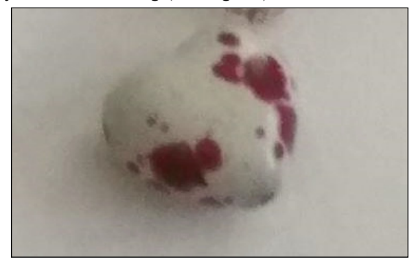
Fig. 10. Stone model "My past"

stones she has chose a "pale" heart (white), "dead heart", which, as she states, gains life signs due to the blood drops (see red drops on the heart), which symbolize suffering (see Fig. 10).