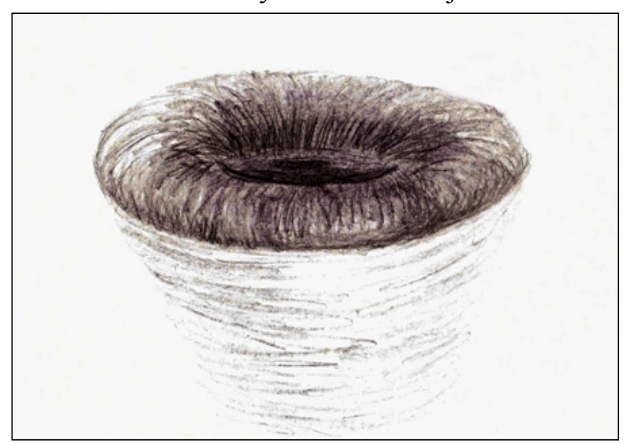
Fig. 2. The person I am afraid of

Fig. 5 illustrates "the dead point" (stop) (see characters "he and she" "above" and "under" the water at the same oar), that can originate destructions. Available energetic asymmetry in the directed contradictory tendencies of the psyche "zeros out" the energy of I, causing appearance of "the black hole". Internal blocade of the activity, its multidirectionality causes "stop" (statics) through blocking of the energy [Yatsenko, 2008]. Hence a need in shock arises irrespectively of its valency ("+" or "-"), which actualizes the manifestation of the blocked energy. Masochism in this context gives a hint to one's own ability to lead the subject "from the