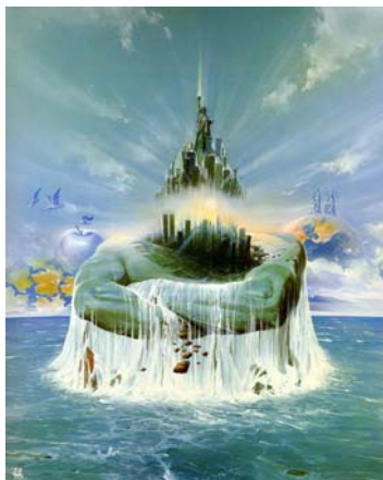
Fig. 2. Wojtek Siudmak – The Strongest

N.: I don't know what to say... I guess it's because I alienate myself, I do not accept my own