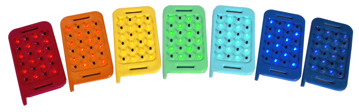
Fig. 5. Photon matrices A. Korobov-V. Korobov "Barva-Flex/24FM"