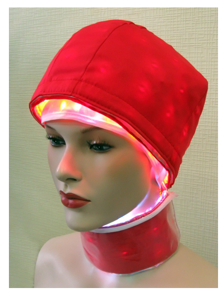
Fig. 3. Apparatus Korobov-Posokhov "Barva-CNS/FM" and matrix A. Korobov-V. Korobov "Barva-Laryngologist/FM"

immune, endocrine, central and peripheral nervous systems. Such tactics of treatment, prevention and rehabilitation gives the fastest and most stable result.