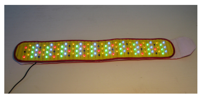
Fig. 2. Photon-magnetic matrix A. Korobov-V. Korobov "Barva-Laryngologist/FM"

In Fig. 3 shows a photo of the "Barva-CNS/FM" apparatus and the "Barva-Laryngologist/FM" matrix mounted on a mannequin in the working position.