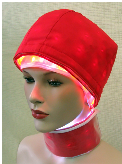
Fig. 3. Apparatus Korobov-Posokhov “Barva-CNS/FM” and matrix A. Korobov-V. Korobov “Barva-Laryngologist/FM”

One of the most versatile personal medical devices for light therapy, developed by us and produced by Laser and Health Corporation, are the flexible photon-magnetic matrices of A. Korobov-V. Korobov “Barva-Flex/24FM” the design of which is described in detail in [29]. The inclusion of these matrices in the composition of the phototherapeutic hardware complex for the treatment and prevention of diseases of the brain is due to their ability to have a normalizing effect on the immune, endocrine, central and peripheral nervous systems. Such tactics of treatment, prevention and rehabilitation gives the fastest and most stable result.