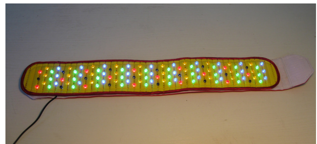
Fig. 2. Photon-magnetic matrix A. Korobov-V. Korobov "Barva-Laryngologist/FM"

In Fig. 3 shows a photo of the "Barva-CNS/FM" apparatus and the "Barva-Laryngologist/FM" matrix mounted on a mannequin in the working position.