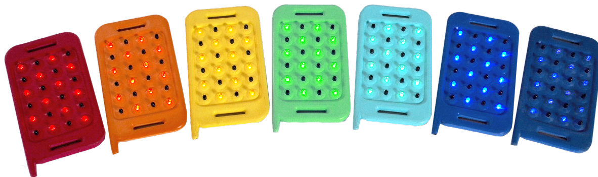
Fig. 5. Photon matrices A. Korobov-V. Korobov “Barva-Flex/24FM”