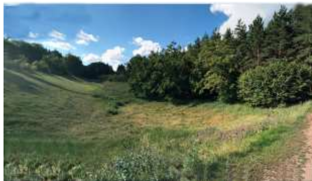
Fig. 2 –The existing relief of the ravine

create a “wet oasis” that will naturally ensure natural thermoregulation and optimization of the microclimate of the surrounding areas of the arboretum. The water mirror will create the conditions for effective thermoregulation and microclimate stabilization, neutralizing temperature stress for introduced species during periods of extreme summer drought. Thus, the created reservoir will act as a natural moderator of the surface air layer.