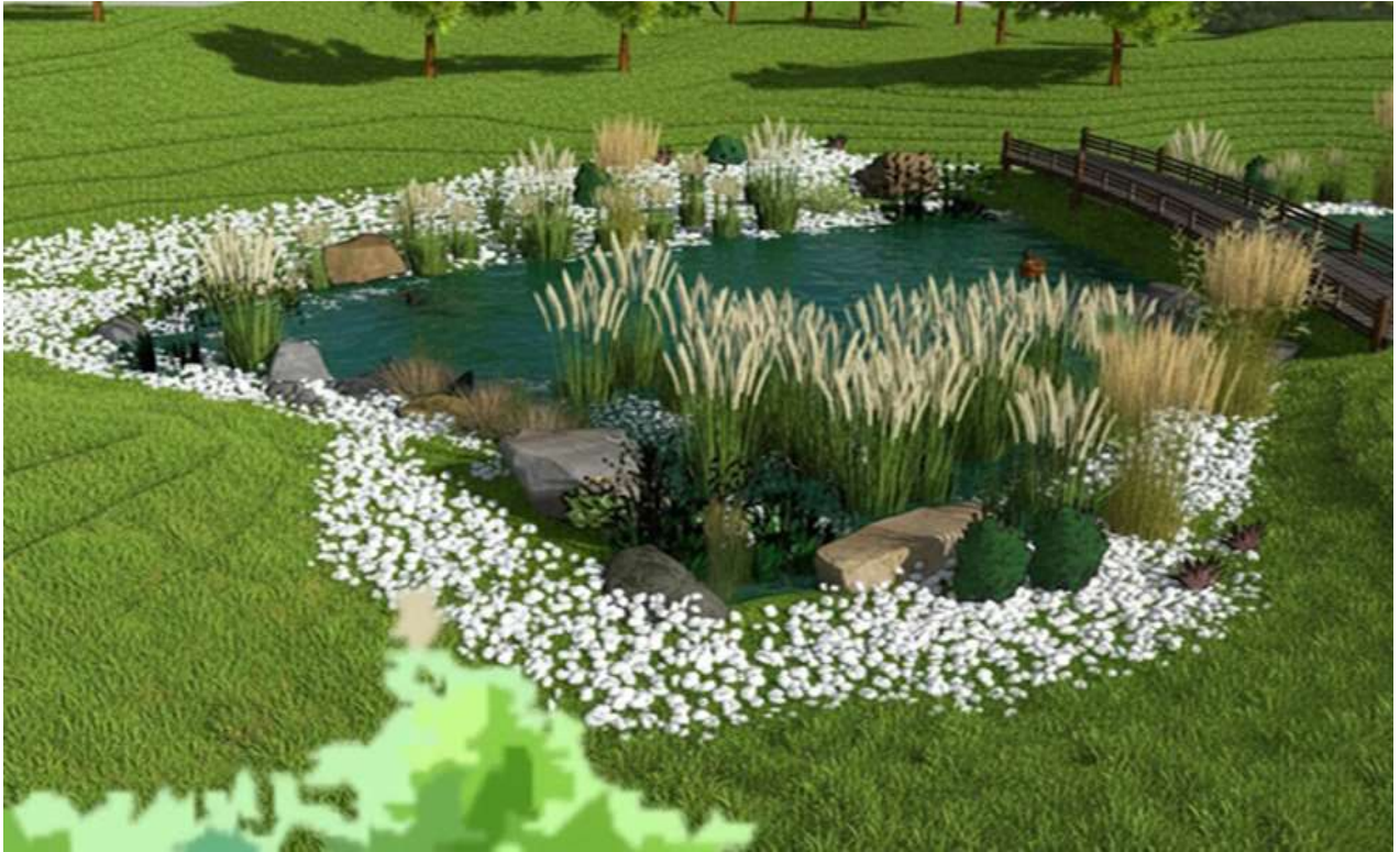
Fig. 5 – Visualization of part of the pond with coastal plantings