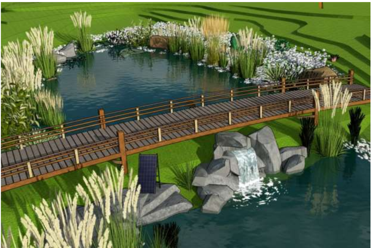
Fig. 6 – Forced aeration and water circulation in the project model of the pond