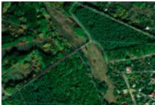
Fig. 1 – Satellite imagery showing the spatial localization of the de-functionalized pond bed within the dendrological park's vegetation structure

the existing ravine to be transformed into a functional ecosystem node for intercepting surface runoff. In order to optimize the water balance of the territory, instead of the process of uncontrolled infiltration of atmospheric precipitation into the lower horizons, it is proposed to install an artificial waterproofing screen. This design solution will transform the pond bed from a drainage area into a functional reservoir for storing meltwater and rainwater. This will