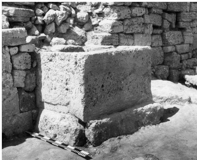
Fig. 2. Well in the atrium of the Roman-era “barracks.” View from the east.

Рис. 2. Колодязь в атріумі «казарми» римського часу. Вигляд зі сходу.