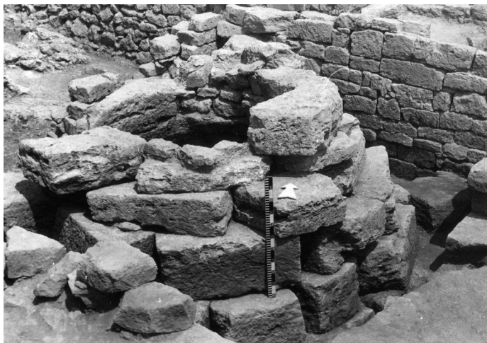
Fig. 4. Cistern 92. View from the south.

Рис. 4. Цистерна 92. Вигляд з півдня.