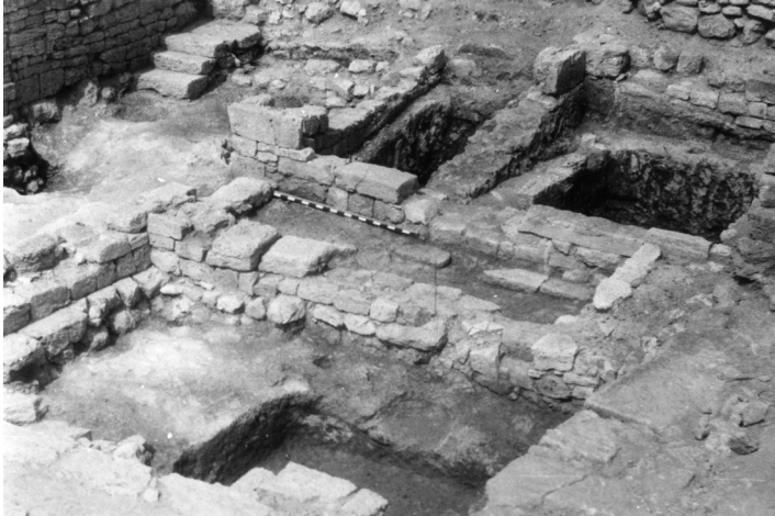
Fig. 3. Remains of the winery. Excavations of 1995. View from the east.

Рис. 3. Залишки виноробні. Розкопки 1995р. Вигляд зі сходу.