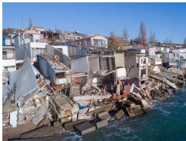
Fig. 3. The coast washout on the outskirts of Chernomorsk

One of the reasons for the chaotic development of the coastal zone of the north-western part of the Black Sea is the fact that the interests of all legitimate users have not yet been recognized. Various administrations and enterprises pursue their «narrow» interests without a «big» connection with each other and do not discuss their plans for the future. However, to protect and preserve the coast, we need to do long-term integrated planning and recognize the legitimate interests of all users.