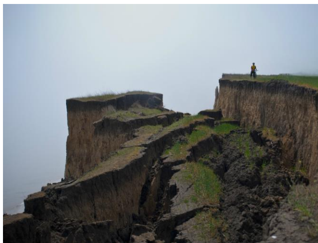
Fig. 2. Landslide in southwest Odessa, village Sanzheika