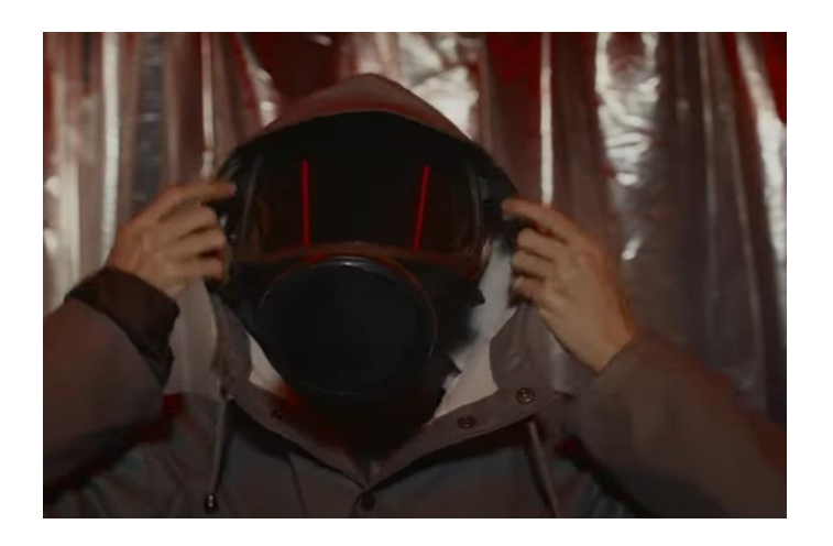
Fig. 2. Eco-friendly aviation? Pigs might fly... (0.26).

Nonverbal elements in environmental videos include images of living beings—people, animals, birds, fish, and plants—who either suffer from environmental threats or experience relief from solving an environmental problem. This embodies the emotional and physical impact of environmental issues, highlighting the contrast between the distress caused by ecological harm and the positive outcomes of environmental solutions. Therefore, these videos prioritize depicting people in dynamic scenes, expressing anxiety, distress, concern about environmental issues, or warning about dire consequences. Videos also center on the struggles of people amidst the impacts of the climate crisis. These active portrayals indexically convey inner states and embody the threats posed by environmental challenges. Fig. 2 embodies the impact of air pollution caused by the aviation industry, depicting the main character wearing a gas mask to safeguard her health.