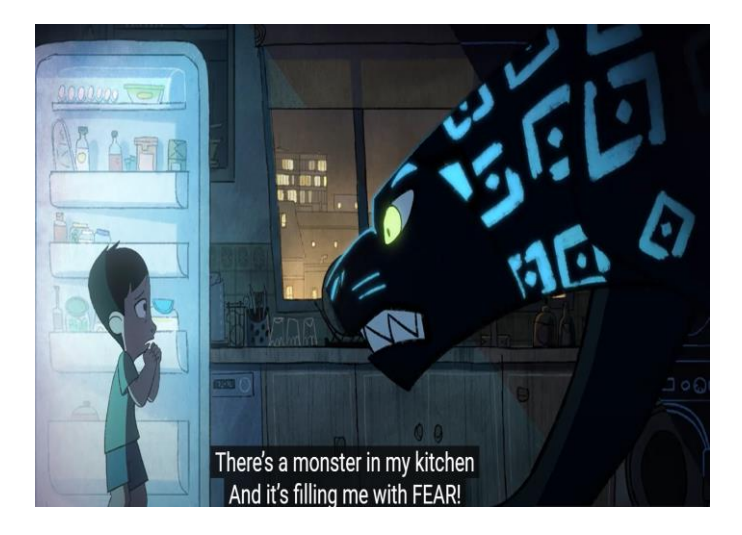
Fig. 4. There's a Monster in My Kitchen. (0.44).

A voice-over serves as a means of embodiment in environmental videos, enabling the verbal expression of thoughts, emotions, and narrative context. This enhances the viewer's understanding and emotional engagement with the content, exemplified in videos such as Vicious Circle , narrated by actor John Hurt over the screen.