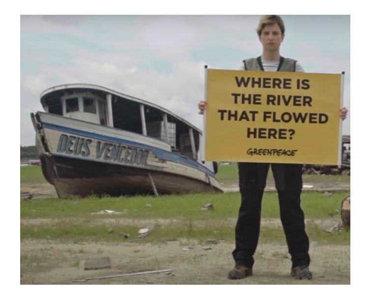
Fig. 9. Greenpeace 2023: there's something in the air. (1.58).

Example (5) illustrates the appeal for immediate action to protect the sea from industrial pollution. The moral issue is constructed through the use of modal words such as need , have to , and must , indicating a strong necessity to reinforce ocean management and the imperative for governmental action. The use of value-laden words like ratify , treaty , protect , and support adds a layer of morality to the narrative. The metaphor at the heart of ocean management emotionally implies that coastal voices should be deeply integrated into the process of managing the ocean. Direct calls to action, such as Support coastal communities and Please sign the petition , encourage the audience to actively participate in the cause.