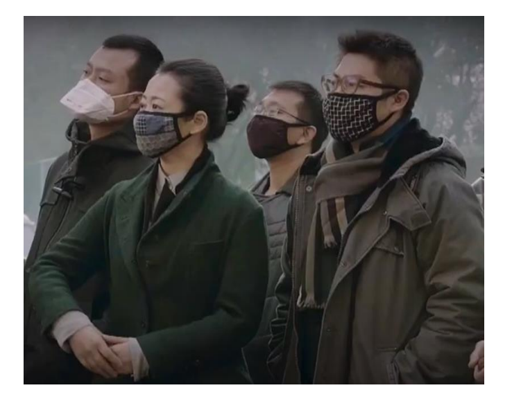
Fig. 13. The air I breathe. (0.33).

The Base Space also activates the Reference Space, detailing elements of situations related to air pollution through various multimodal elements, where referential meaning is constructed.