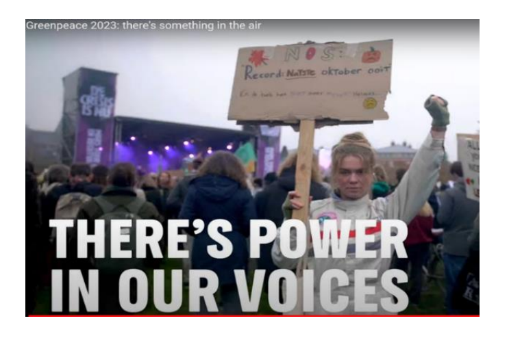
Fig. 10. Greenpeace 2023: there's something in the air. (1.59).

Images of people implementing solutions to environmental challenges illustrate the potential for positive change and collective action. They construct ideological meaning by promoting hope, empowerment, and optimism about the possibility of achieving a sustainable future. Fig. 11 illustrates the determination of environmental activists to defend the right to a clean environment through legal action.