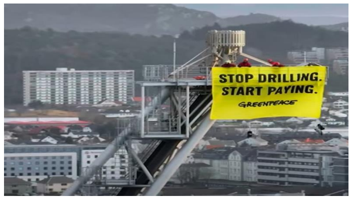
Fig. 8. Greenpeace 2023: there's something in the air (1.57).

Calls to action, slogans, and demands are the integral element of ideological meaning within videos. They serve as direct appeals to viewers, urging them to take specific steps and actively participate in environmental advocacy, for instance, Stop mining the deep sea in the video Protect deep sea . Such utterances can be realized through the audial mode by the spoken text or through the visual mode by the images of inscriptions on posters, on the surfaces of buildings, ships or industrial constructions as in Fig. 8.