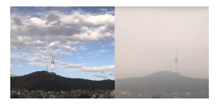
Fig. 15. The air I breathe. (0.43).

In the Relevance Space, the constructed meaning emphasizes the urgency and moral imperative of addressing air pollution. The ideological meaning constructed here stresses the importance of collective responsibility and the necessity for societal and governmental change to ensure safe air quality.