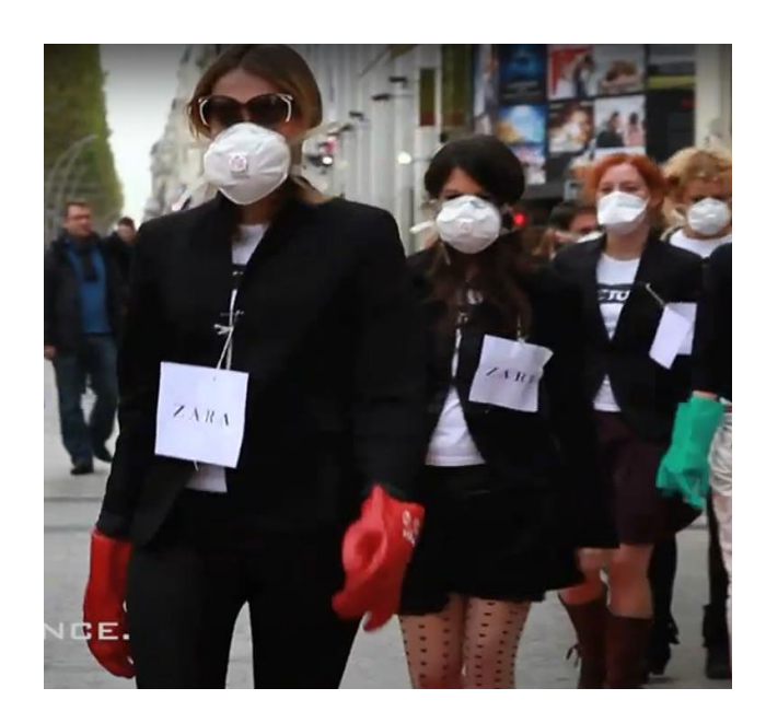
Fig. 3. ZARA Mannequins Revolt! (0.26).

Cinematic elements play a crucial role in embodied meaning. Camera positioning can significantly impact the viewer's sensory-motor activity, eliciting a strong emotional reaction. (Heimann et al., 2014).Cinematic devices engage viewers in a bodily experience through the expressive actions of characters seen and heard on screen. They not only embody meanings but also make them tangible and material, bringing them to life.