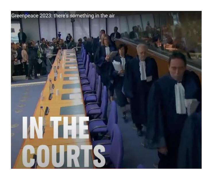
Fig. 11. Greenpeace 2023: there's something in the air. (1.07).

Images of people implementing solutions to environmental challenges illustrate the potential for positive change and collective action. They construct ideological meaning by promoting hope, empowerment, and optimism about the possibility of achieving a sustainable future. Fig. 11 illustrates the determination of environmental activists to defend the right to a clean environment through legal action.