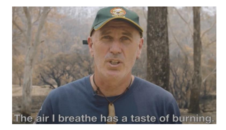
Fig. 12. The air I breathe. (0.03).