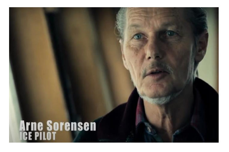
Fig. 6. Why Arctic sea ice melting matters. (0.14).

Regarding cinematic means, wide shots (Fig. 4) serve to establish the relationship between characters and their environment, while bird's-eye views provide a broader perspective of the scene. Close-ups focus on authority figures (Fig. 5), and medium shots highlight living beings in peril. These varied shots help implement the urgency and reality of the environmental issues depicted.