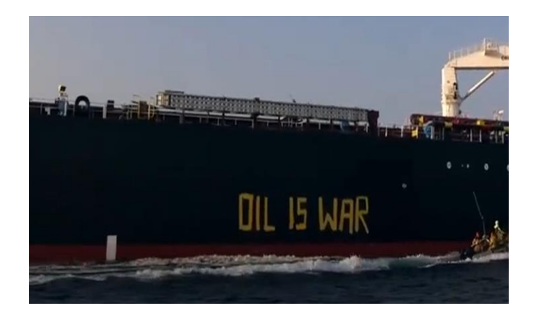
Fig. 7. The end of 2022 - Greenpeace (1.45).

The use of metaphors and metonymies serves to symbolically convey complex issues related to environmental issues making them more accessible and emotionally compelling to viewers, for instance, greenwash , give Earth the hand , oil fuels war , climate-wrecked crime , wrapped in plastic , etc . Fig. 7 employs the metaphor oil is war to highlight the ideological meaning that oil extraction devastates the environment and leads to severe consequences for humanity.